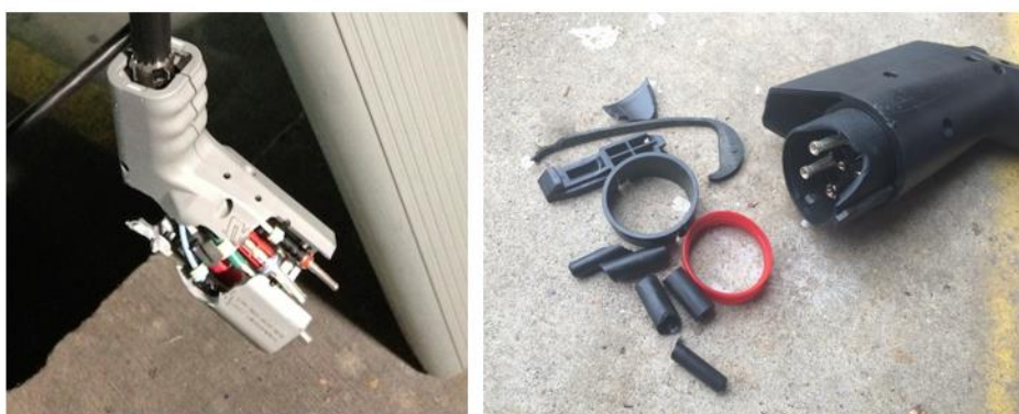
Figure 2. Common mechanical failures of connectors, including damage to the housing (left [3]), damage to the mating interface (right [4])

The problem of mechanical damage of connectors is that it increases the risk of incidents. Fracture of the mating interface may cause latch connection failures and/or communication issues during charge sessions. In a worst-case scenario, this could lead to hot disconnections, arcing and burning or electrocution of end-users. A fractured handle brings along an increased risk of cuts. Fracture to a connector housing, total mechanical failure and failure of a strain relief all imply a loss of IP protection in the best case, and exposed live parts in the worst case. Either way, this could lead to short-circuit or electrocution incidents.