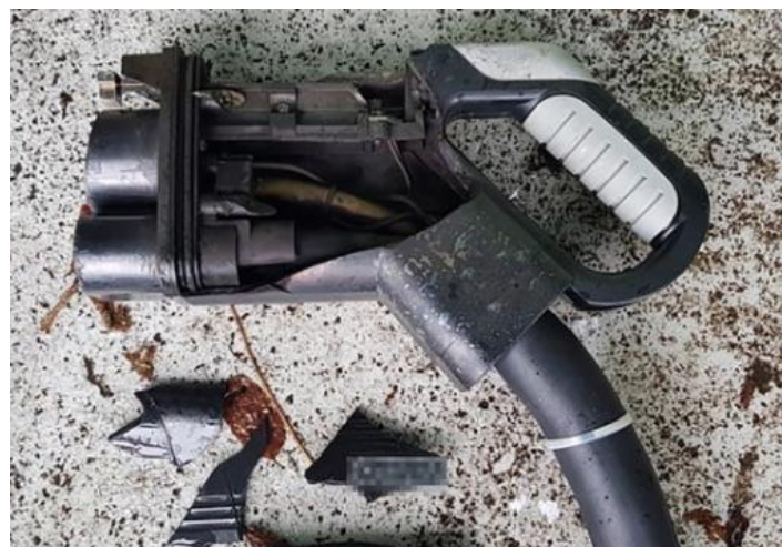
Figure 4. Exploded connector, Daegu, South Korea, 2018. The explosion was allegedly caused by a short-circuit [7].